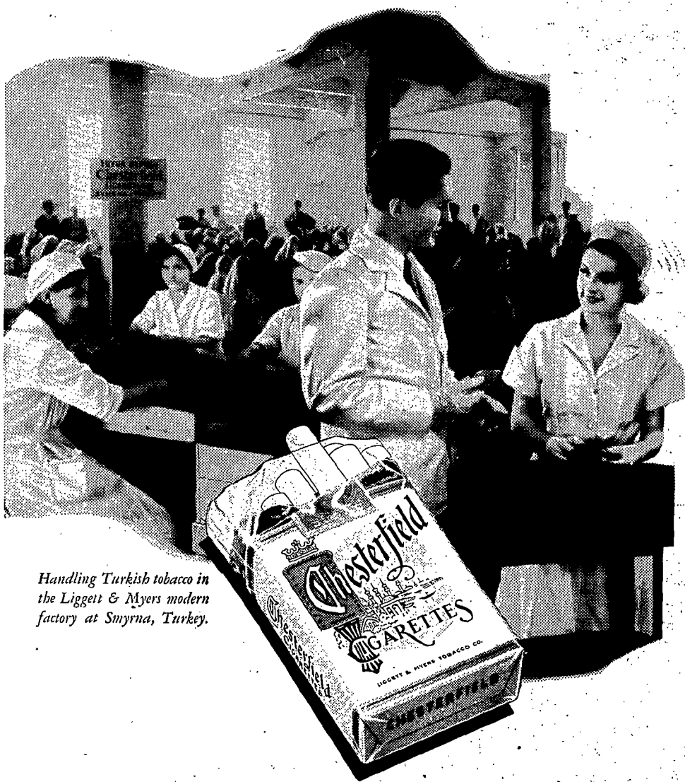
Handling Turkish tobacco in the Liggett & Myers modern factory at Smyrna, Turkey.

The selection, buying and preparation of the right kinds of Turkish tobaccos for making Chesterfield Cigarettes is a business in itself . . .