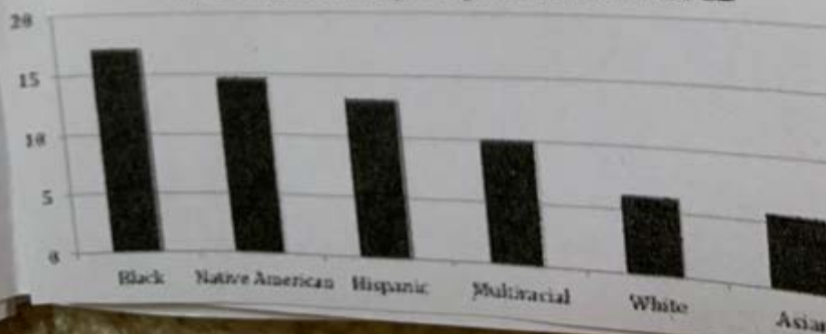
Total Student Body Suspended 2004-2012